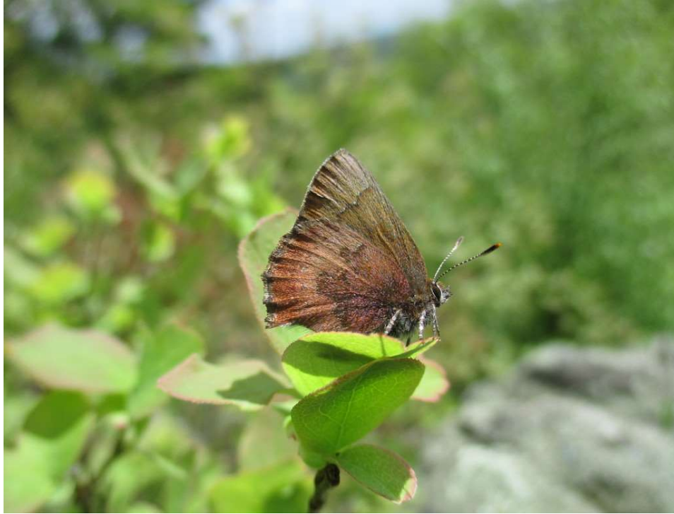
Above: a Brown Elfin butterfly perches on its host plant, Lowbush Blueberry.