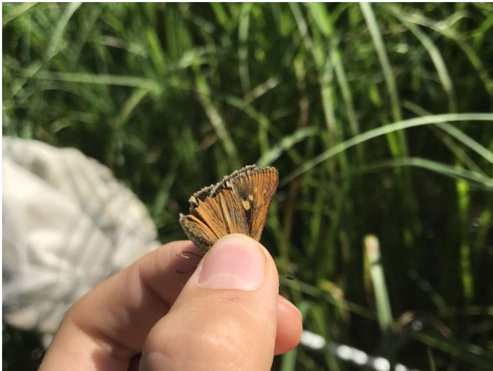
A male Dion Skipper captured at the NWR Floodplain site. It was released unharmed.